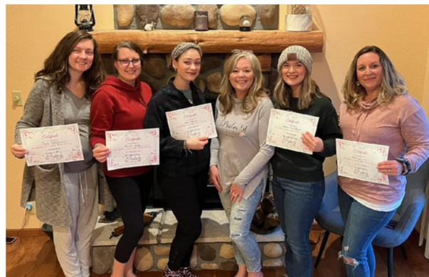
The second retreat group completing their "Heart Helper" certification